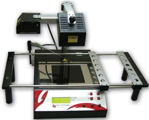
JV-001 RE-7500 BGA Rework System

The RE-7500 can be used to remove and reflow all SMD components, including BGA, CBGA, CCGA, CSP, QFN, MLF, PGA, epoxy underfilled \mu BGA's, and more.