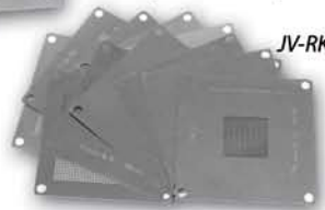
JV-RKS Universal Kit

Contains 12 different masks of various pitch and size, which allows for the reworking of most BGA IC's. Kit comes complete with precision tooled jig.