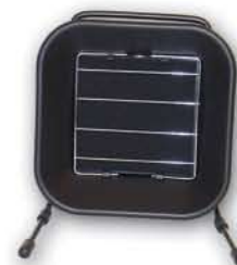
JV-493 Soldering Smoke Absorber

Efficient and quick elimination of toxic gases and fumes. Extended service-life, low noise fan is very durable and has strong suction. Filter is made with refined activated carbon, which has excellent absorption characteristics. Quick and easy filter replacement.