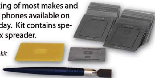
JV-RKC Cell Phone kit

Contains 52 BGA masks which allows for the reworking of most makes and models of cell phones available on the market today. Kit contains special jig and flux spreader.