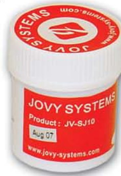
JV-SJ10 10g Solder Paste

Jovy solder paste JV-S000 contains solder powder and flux. It also has excellent chemical stability. Jovy series provide significantly longer shelf life than ordinary solder pastes. Good printability and careful dispensing makes for high quality reflow soldering.